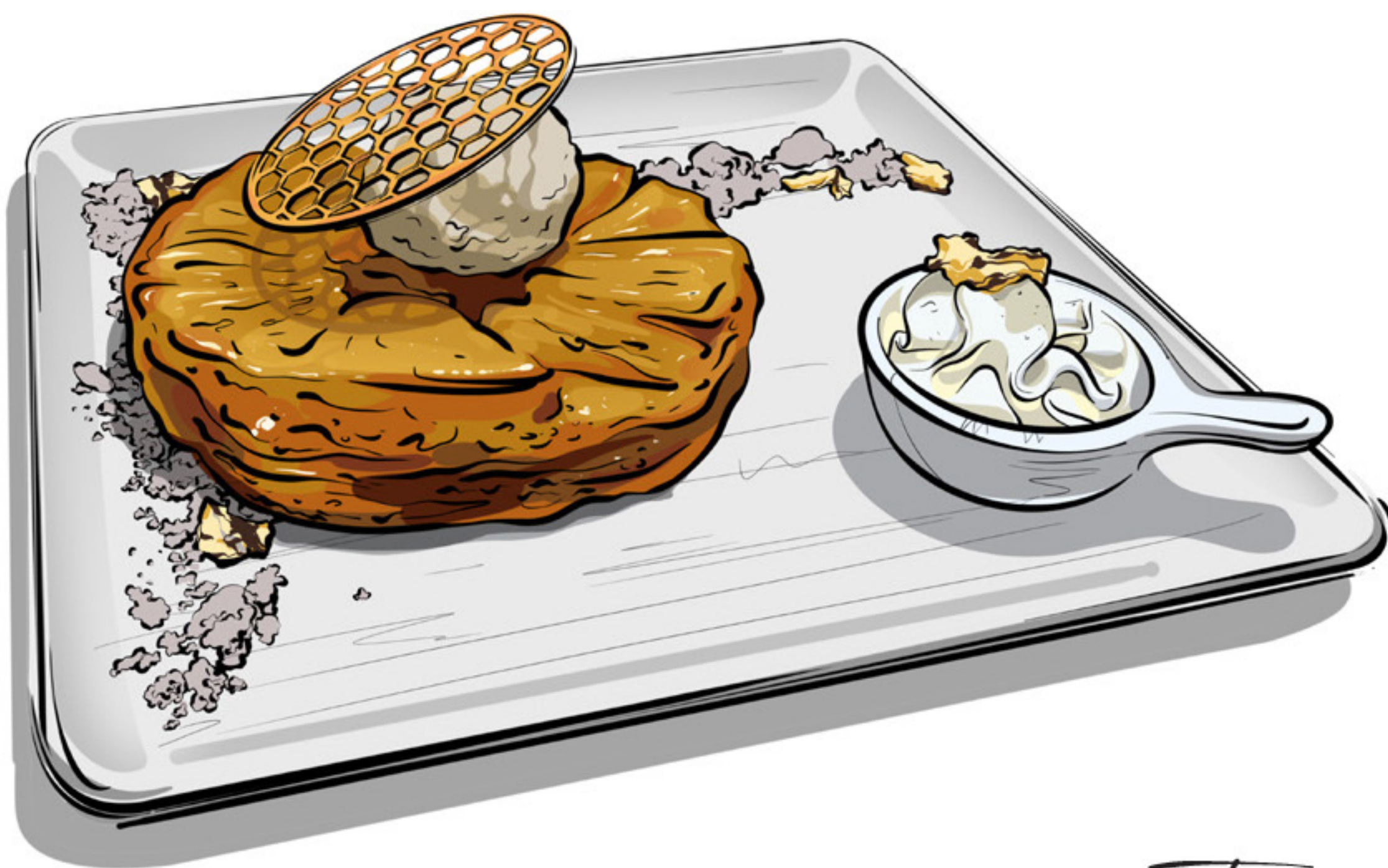
Torta di mele caramellate 35k

Caramelized red apple taste served with vanilla ice cream and whipped fresh cream