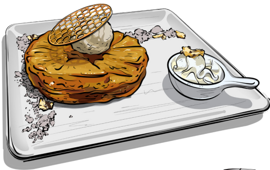
Torta di mele caramellate 35k

Caramelized red apple taste served with vanilla ice cream and whipped fresh cream